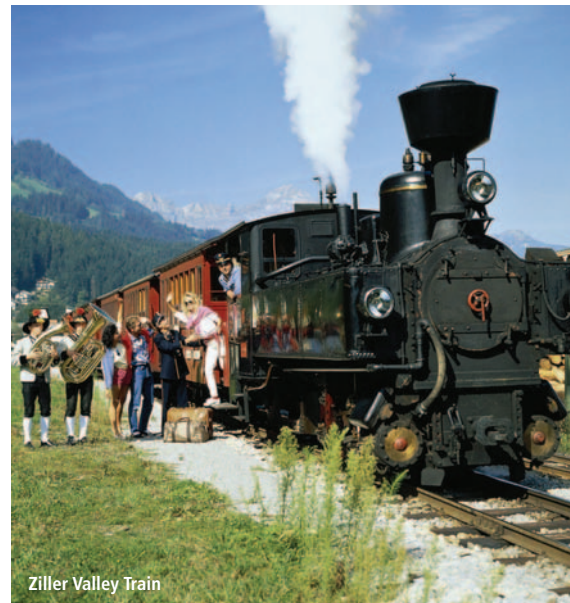
Ziller Valley Train

Day 6 A leisurely excursion to Rattenberg and Lake Achen. The medieval walled town of Rattenberg, the smallest city in the Tyrol, is now known as the provincial home of glass and crystal. Visit one of the showrooms and perhaps see the artisans at work painting and engraving crystal and glassware.